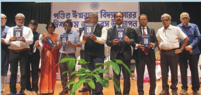
Release of 3rd Volume of Vidyasagar Rachanavali in the ceremonial opening of the birth bicentennial of Pandit Iswar Chandra Vidyasagar

The faculty members of all departments blend research and publication