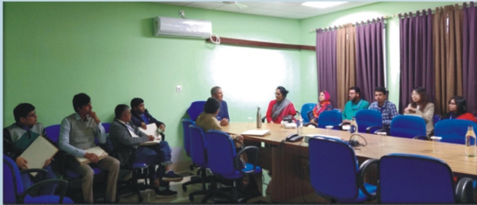
Interaction session of Research week on Environmentalism