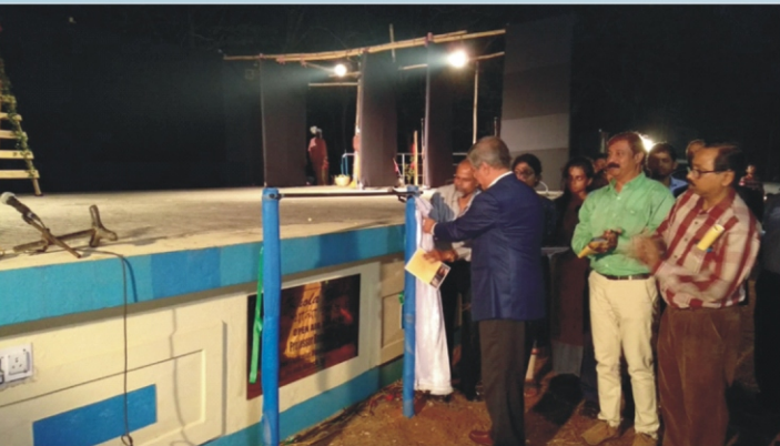
Inauguration of the open air theatre "Khola Haoa"