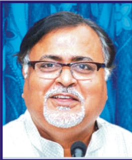
Dr. Partha Chatterjee the Hon'ble Minister- In - Charge of the Department of Higher Education Govt. of West Bengal.

It has been some time since the last issue of this folio reached you. In the mean time our university has been able to champion the spirit of progress in the academic circle of West Bengal and spread the message to other parts of the country.